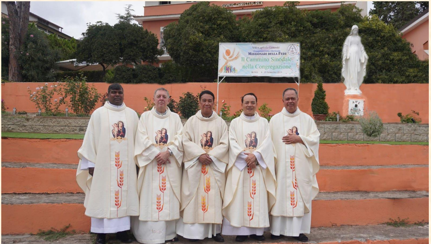
Very. Rev. Fr Superior general and councillors.