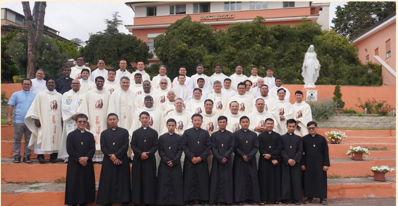
Photo: closing day of the 8 th General chapter