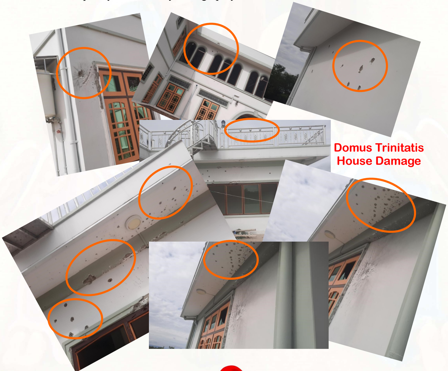
Domus Trinitatis House Damage