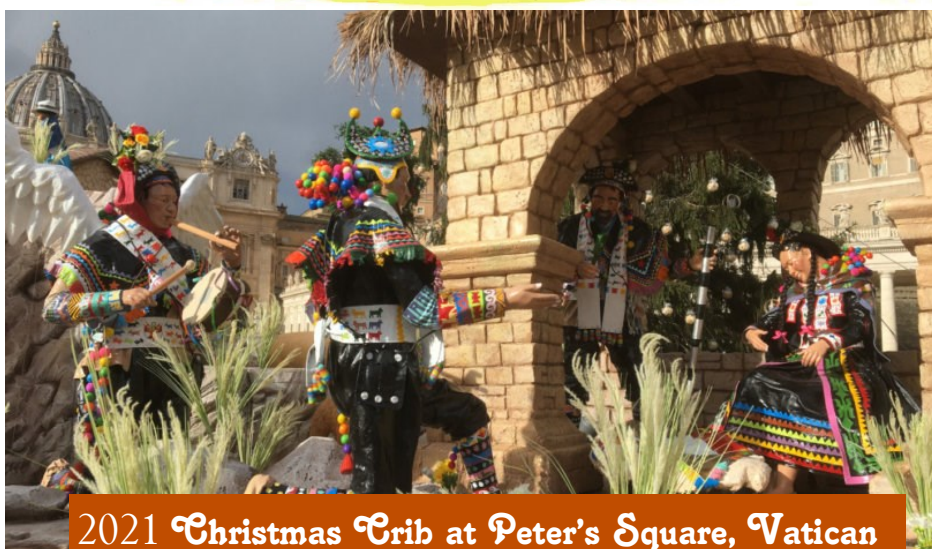
2021 Christmas Crib at Peter's Square, Vatican