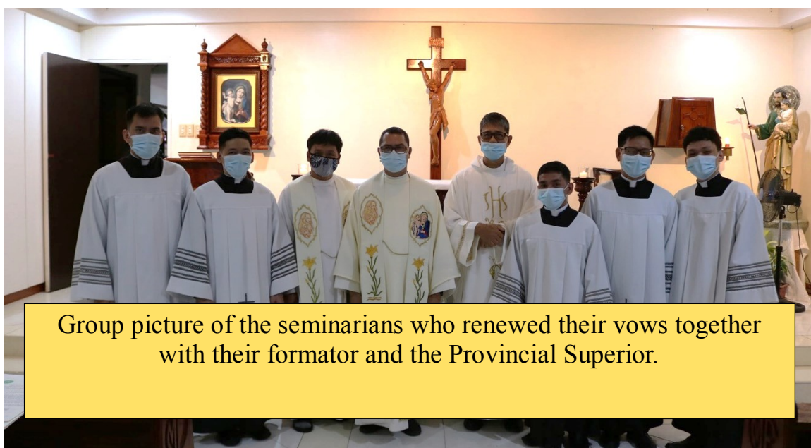
Group picture of the seminarians who renewed their vows together with their formator and the Provincial Superior.