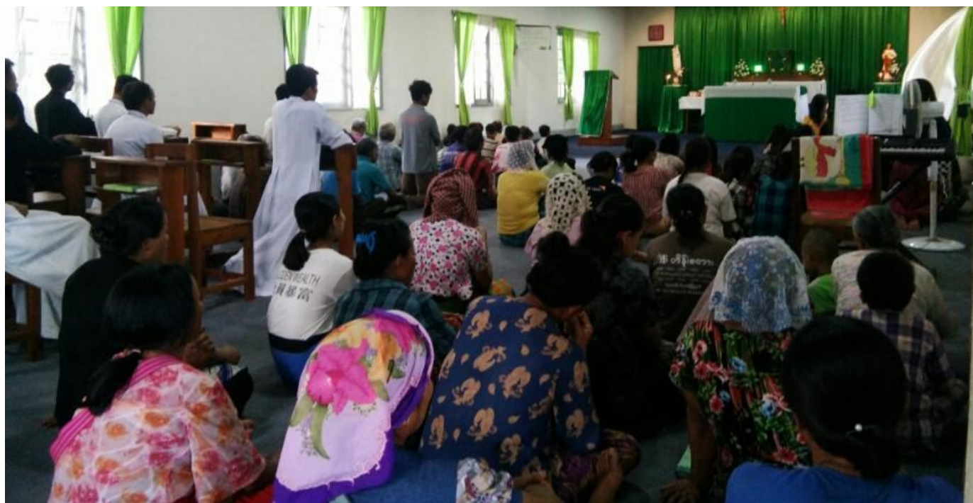
Mass with Refugees at Vice-Provincial House Chapel