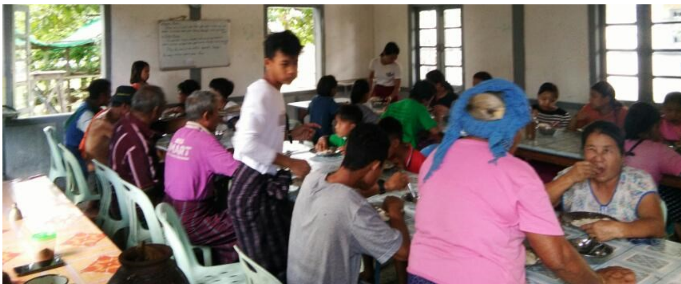
Food Service at Vice-Provincial House_Doungankha

Naypyitaw for safety. The curia office of vice-province is temporarily closed and important documents were moved to a safe place. The curia house, Domus Mater Fidei , has not yet been affected by any damages.