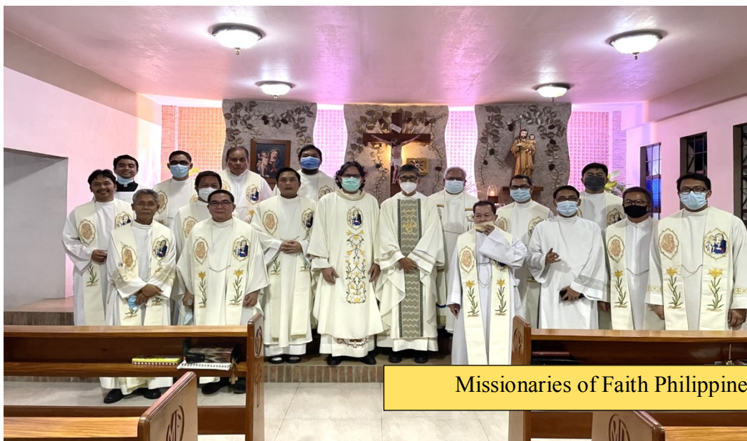
Missionaries of Faith Philippine Province.